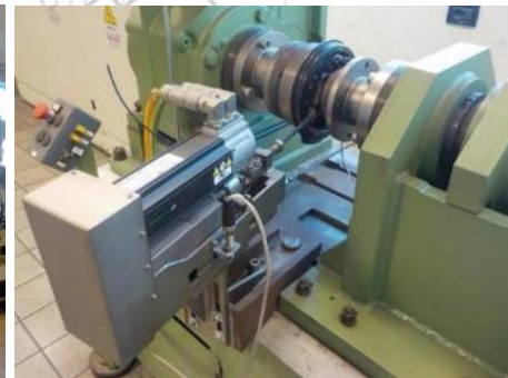
Examples: fatigue testing on a mechanical test rig